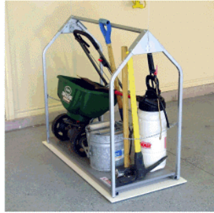
Spreaders, Sprayers, Shovels