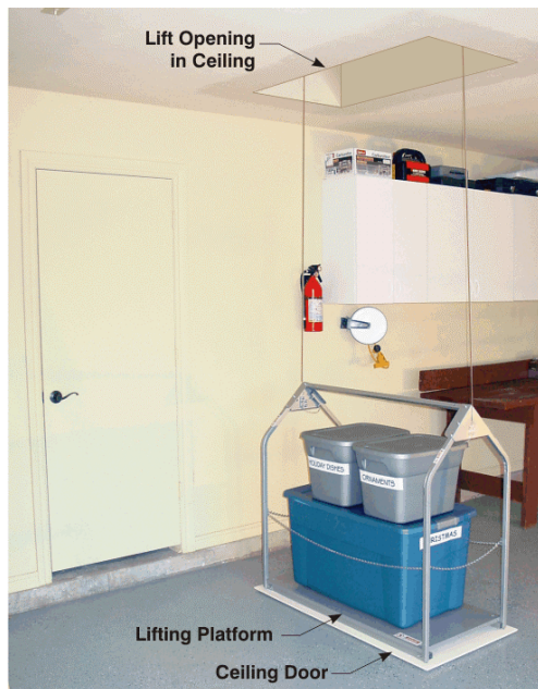
View from garage with lift platform down.

The Versa Lift is a powerful electric lift that eliminates the need to risk serious injury* by trying to get storage items up a narrow, shaky ladder. The push-button remote control sends down the lifting platform hidden inside the attic. The lifting platform stops instantly when it reaches the floor below. Next, you load the platform with up to 200 lbs. of storage items and press the up button on the hand-held remote control. In just seconds the load is transported into the attic and out of sight! Upstairs the lifting platform automatically stops flush with the attic floor so you can simply slide storage boxes off the platform without lifting them, a unique Versa Lift feature.