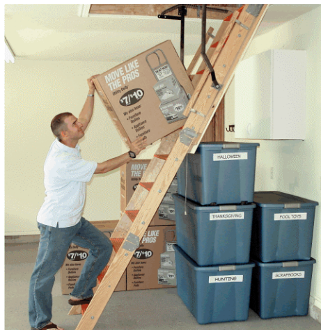
Carrying heavy items up attic stairs is difficult and dangerous.

Most homes have usable attic storage space, but it is typically either undeveloped, or at least, under-developed. Your attic may be poorly lighted, might not have decking (flooring) over the ceiling joists and, typically, the only way to put things up there is to carry them up the narrow ladder... not only difficult, but also very dangerous.