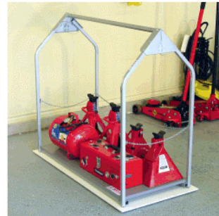
Tools, Jack Stands, Air Tanks