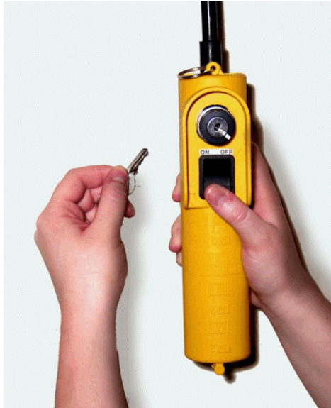
Standard remote with locking key switch