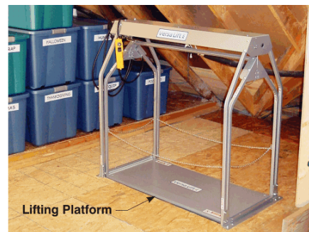
Lift platform stops level with the attic floor.