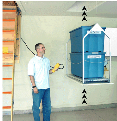
Store or retrieve hefty loads with push-button controls!

But don't despair! Now you can convert your attic into the ultimate storage solution. Just add some lights, plywood decking, and a Versa Lift and your attic can become a huge hidden storage area with push-button access to store and retrieve garage clutter items in seconds!