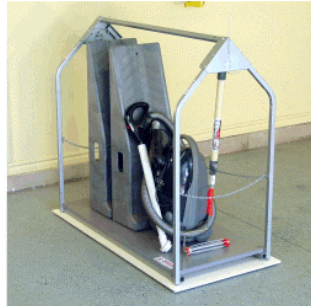
Auto Ramps, Painting Tools