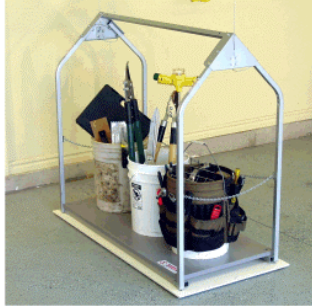
Tool Buckets & Hand Tools