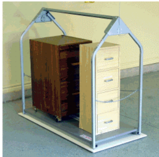
File Cabinets, Tax Records