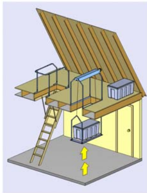
2. Press the UP button