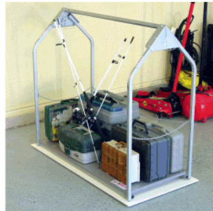
Fishing Poles, Tackle Boxes