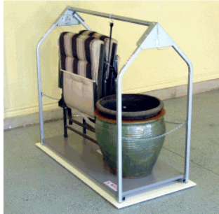
Lawn Chairs, Planter Pots