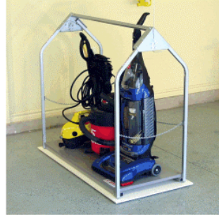
Pressure Washer, Vacuums