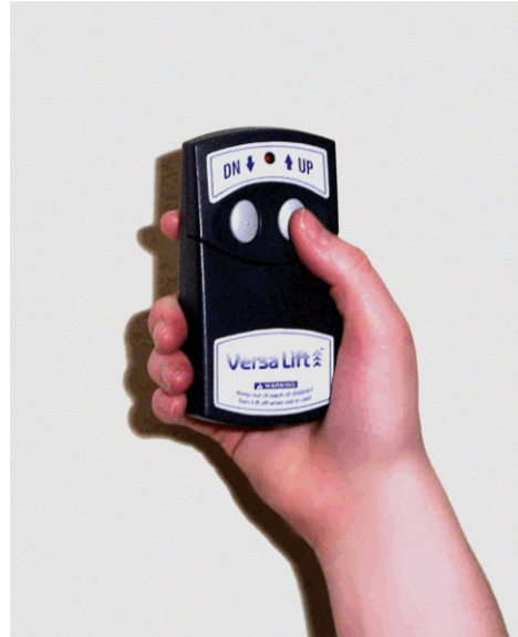
Wireless remote for extended mobility

The lift operation is controlled by either a corded remote control or a wireless remote, similar to a garage door opener. Corded models feature a 15-foot cord and a key-locking main switch to prevent unauthorized use. Wireless models feature a radio remote for maximum mobility that can be stored securely out-of-reach wherever you choose.