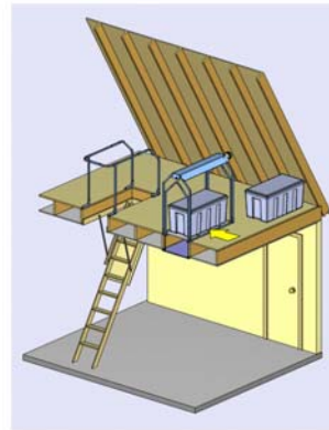
3. Store items in the attic