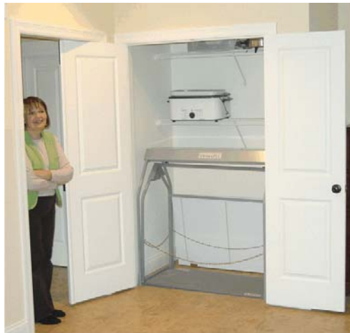
Installed in elevated or split-level homes, the Versa Lift saves carrying everything upstairs.