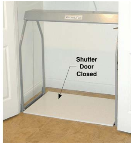
Whenever the lifting platform is lowered, the auto-shutter option closes the opening.

In addition to attic installations, the Versa Lift is an ideal solution for split-levels, elevated coastal homes, and basements. Whenever the living level of the home is above or below the entry level, homeowners are faced with the never-ending task of carrying everything up or down stairs. Items such as groceries, laundry, dry cleaning, and other household supplies all have to be toted to or from the garage/entry level of the home to the living quarters... that is, unless a utility lift is installed in the home.