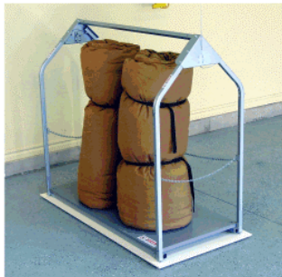
Camping Bags, Tents, & Gear