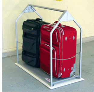
Luggage and Trunks