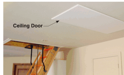
The lift automatically closes the ceiling door.

Another unique feature is the self-closing ceiling door attached to the lifting platform. When the platform is raised, the ceiling door is held tightly against the ceiling opening. The ceiling door can be insulated and sealed for use in a climate-controlled area. When not in use, the Versa Lift and lifting platform is hidden within the attic. All you see is the neat ceiling door overhead!