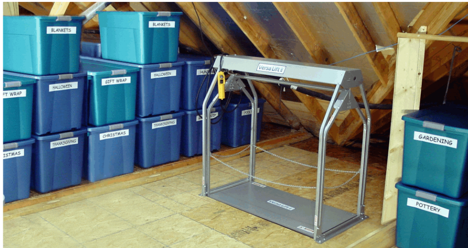
Automated solution: Out-of-sight storage with push-button access.