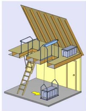
1. Place items on platform