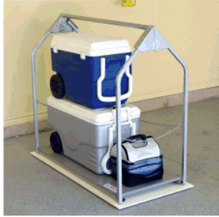
Ice Chests, Coolers

In addition to storage boxes and plastic bins, here are a few of the items you can make disappear like magic and get back just as fast: