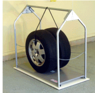
Wheels & Tires