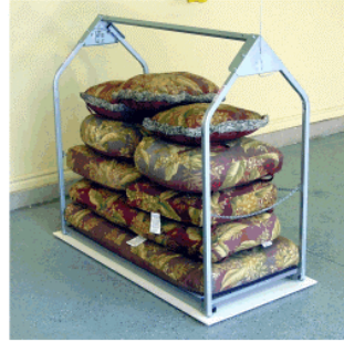
Pool & Patio Cushions